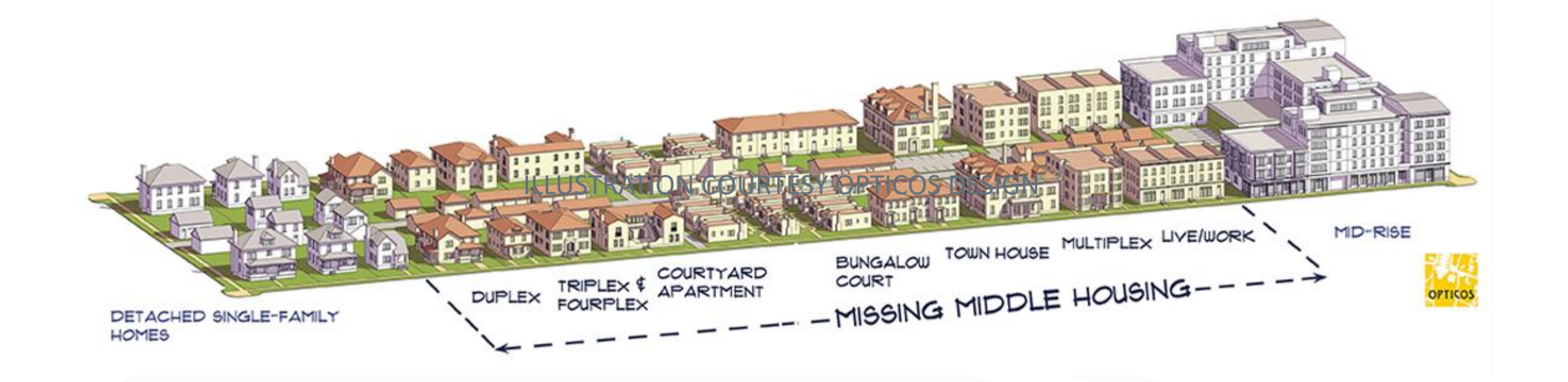
ILLUSTRATION COURTESY OPTICOS DESIGN